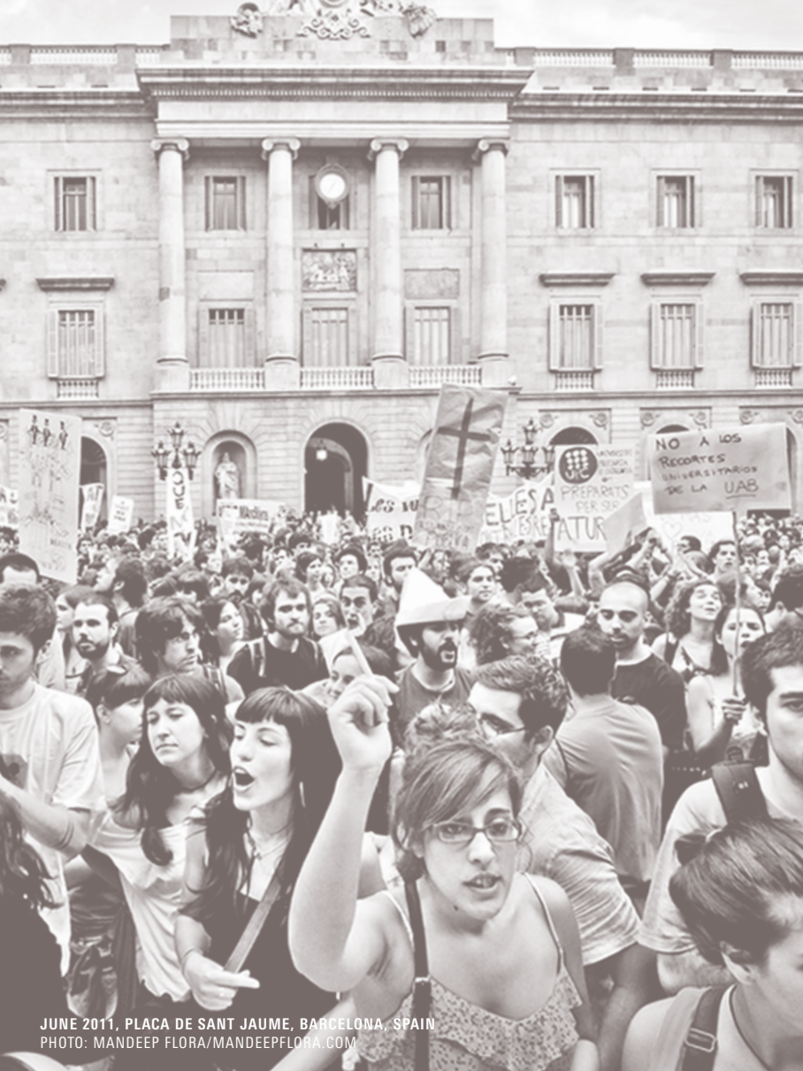
JUNE 2011, PLACA DE SANT JAUME, BARCELONA, SPAIN